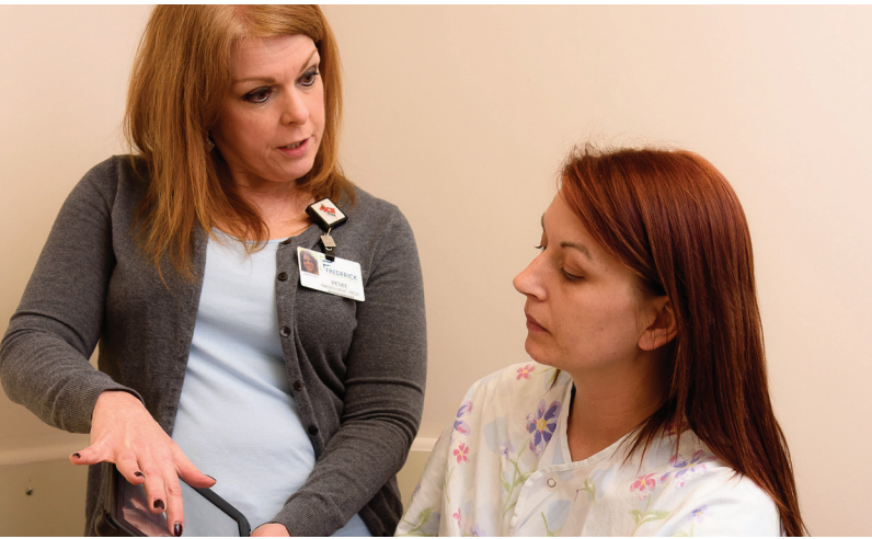
The patient answers questions about her personal habits and family history on a wireless tablet at her screening mammography appointment.