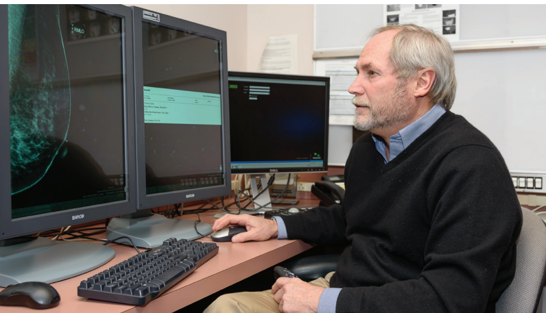
The clinically validated risk calculation software program used by FMH Imaging Services converts the data entered to calculate each patient's individual risk for developing breast cancer and makes it available to the interpreting radiologist immediately.

credentialed as an Advanced Practice Nurse in Genetics through the Genetic Nursing Credentialing Commission—reviews each patient's family history to determine if testing for certain genetic markers for breast cancer (BRCA1 & BRCA2 mutations) is appropriate.