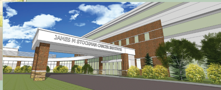
Above left: Artist's rendering of the Cancer Institute's expanded Infusion Center with a view of outdoor gardens. Above right: Artist's rendering of exterior entrance to the facility.

Located on the hospital’s Rose Hill campus, the James M. Stockman Cancer Institute will allow FMH to continue providing local residents with high quality, patient-centered cancer care in an environment that is even more convenient, comforting and healing. At nearly twice the size of the existing facility, the new Cancer Institute will house everything that patients fighting cancer and their families need--all under one roof, in one, convenient, easily accessible location.