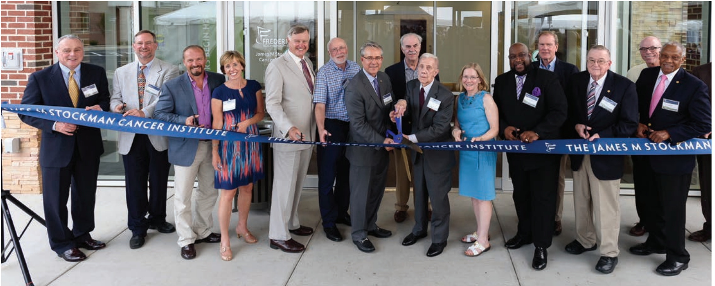
Members of the Frederick Memorial Hospital Board participated in a ribbon cutting ceremony of the James M Stockman Cancer Institute on July 27, 2017.

Frederick Regional Health System's James M Stockman Cancer Institute brings state-of-the-art cancer care to the heart of Frederick County. This, along with our affiliation with MD Anderson Cancer Network ® , means that patients don't have to travel far from home to receive the very latest advancements in cancer treatment and technology.