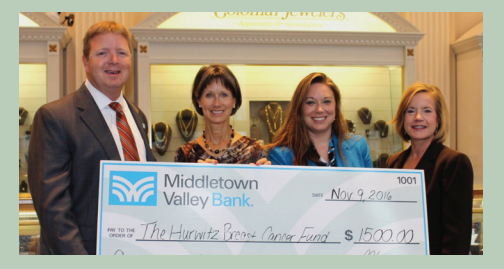
Business & Organization Support Middletown Valley Bank was one of many local businesses and organizations that raised money for the Fund during the month of October.

School Support Local schools and sports teams stepped up to raise money for and awareness of the cause.