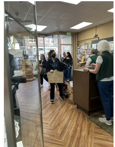
Bag sale photos