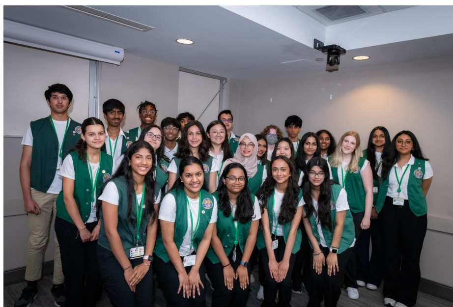
Group Photo—President's Volunteer Service Awardees