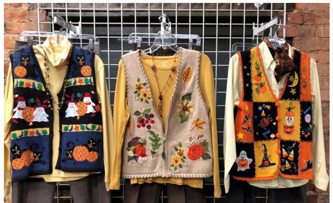
Beautiful Displays at the Select Seconds

8 East Patrick Street, Frederick, MD 21701