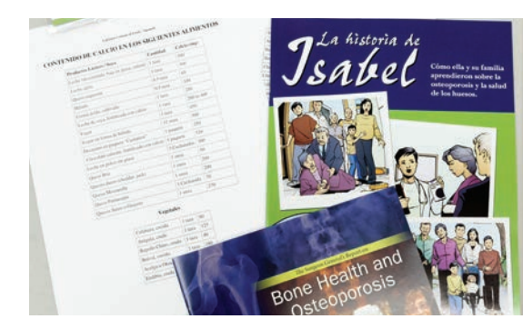
Women's Health Navigators provide osteoporosis screening, follow-up care, and education.

Bone density screenings assess a patient's risk of developing osteoporosis, a dangerous weakening of the bones that significantly increases the risk of serious injury and/or complications from falls and broken bones. Women who are identified as being at risk for osteoporosis receive a scan of their ankle bones. Patients whose scans reveal signs of low bone density are referred to FMH for more in-depth testing.