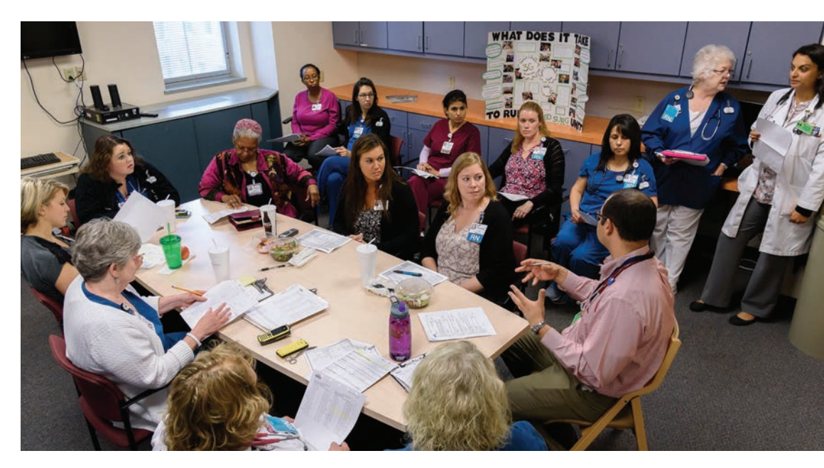
Hospitalists at FMH collaborate with others involved in patient care, including nurses, social workers, pharmacists, nutritionists, a chaplain, therapists, and nursing assistants during Multidisciplinary Rounds on 3-G.

Multidisciplinary Rounding at FMH is based on a similar idea to the flight check a pilot