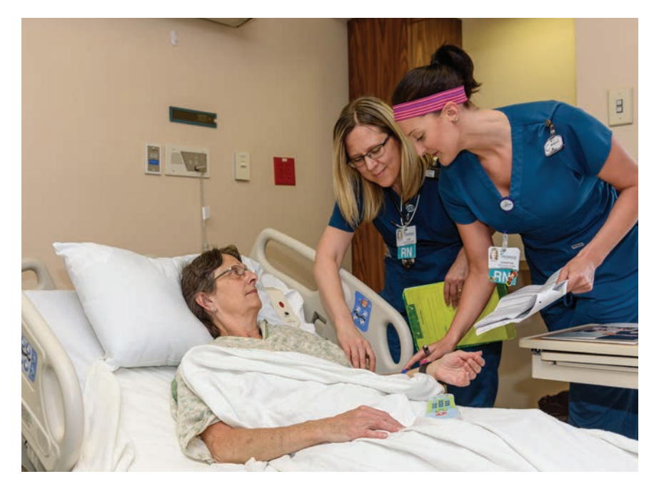
Moving the conversation between nurses at the change of shift to the bedside enables patients and families to contribute information, correct inaccuracies, ask questions, and learn first-hand about their plan of care.

Add that to what has historically been a lack of information about your daily care and the results have been, for many patients, less than satisfying. For example, during the change of shift, when nurses who had been caring for you