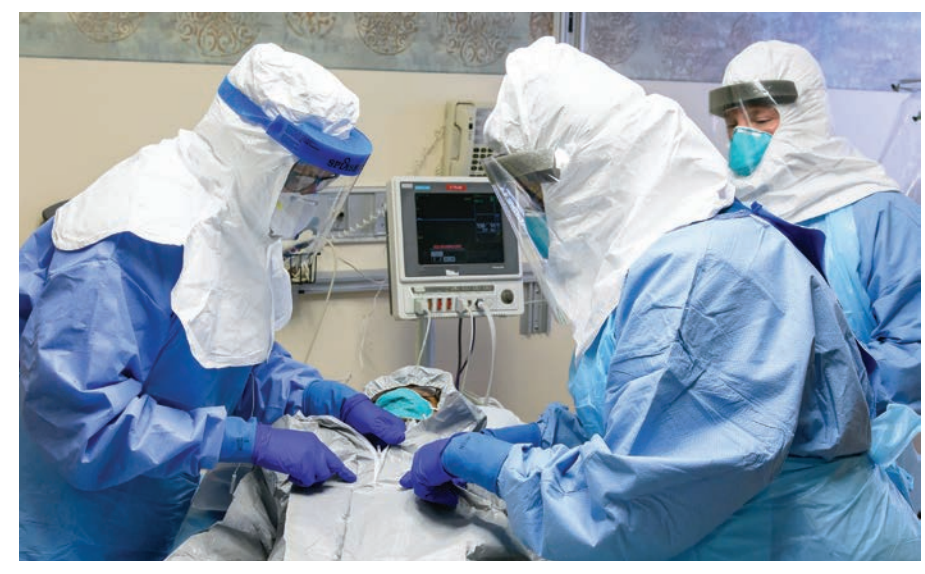
Our H.E.R.T. members commit to four hours of drills each month. In this practice exercise, Emergency Department nurses, physicians and other hospital staff members practice hospital protocols for patients suspected of having the Ebola virus or another highly contagious or infectious disease.

H.E.R.T. is made up of physicians, nurses, pharmacists, interpreters, security officers, and volunteers, as well as representatives from plant operations, environmental health services, materials management,